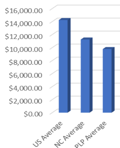
2021 Per Pupil Allotments

PLP receives only 86% of the per pupil funding compared to a traditional public school in North Carolina.